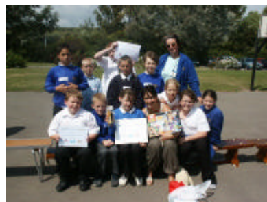
St Peter’s Primary School team