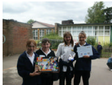
Creative car winner 'Beauty'