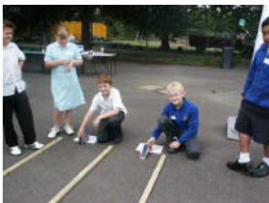
Getting ready for the final!

Creative Car Competition: WINNER – 'Dimmock Special' by Cage Green Primary School RUNNER-UP – 'The Dragonfly' by Platt CEP School