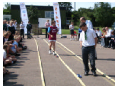
Racing down the track