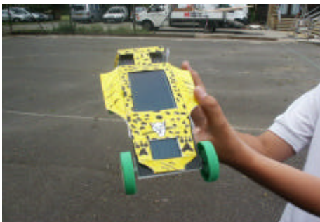
'The Cheetah' – Cage Green Primary School