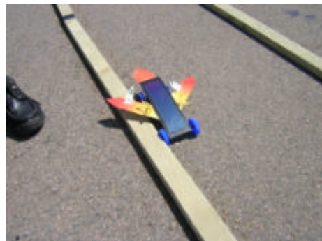
'Thunderflyer' – Sheldwich Primary School