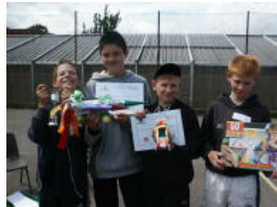
The champions from Barn End Centre