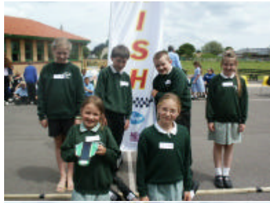
The team from Wingham Primary School

Creative Car Competition: WINNER – ‘Formal Focus’ by Deal Parochial School