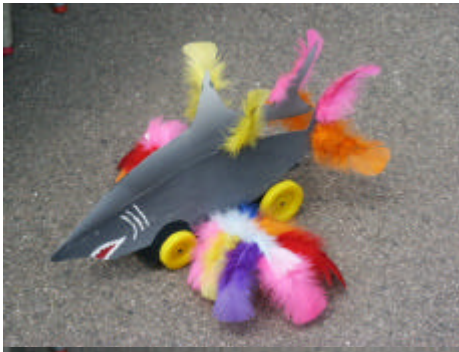
'Polly Shark' – Challock Primary School

Some of this year's resulting car designs are shown below.