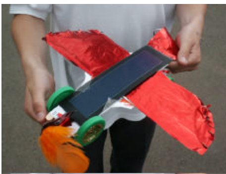
'Flaming Hot Dragon' – Palmarsh Primary School