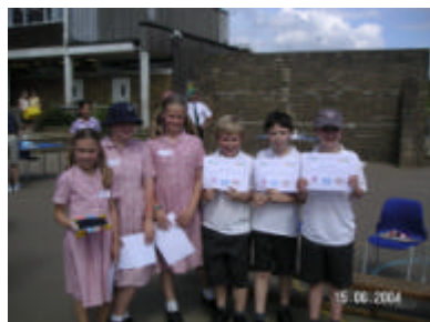
Chiddingstone CEP School