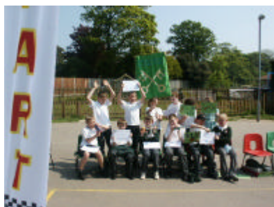
• The victorious winning team!

Creative Car Competition: WINNER – ‘Bat Boy’ by St Saviours CEJ School RUNNER-UP – ‘Fireball’ by Chilton Primary School