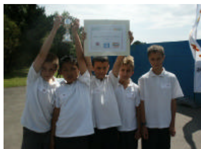
Palmarsh Primary School team

Creative Car Competition: WINNER – ‘The Mummy Mobile’ by St Peter’s Primary School RUNNER-UP – ‘Flaming Hot Dragon’ by Palmarsh Primary School