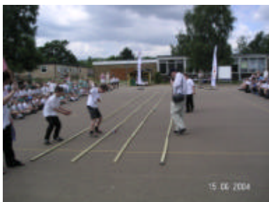
Willing the car down the track!

Creative Car Competition: WINNER – ‘Flaming Fast Fire’ by High Firs Primary School RUNNER-UP – ‘Va Va Voom’ by Our Lady of Hartley Catholic School