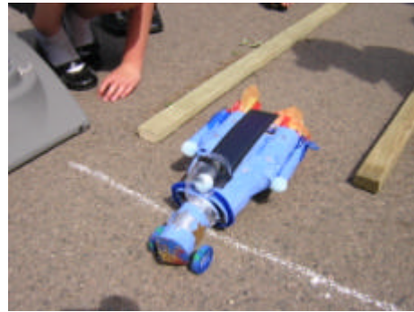
'Graveney Solar Star' – Graveney Primary School