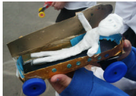
'The Mummy Mobile' – St Peter's Primary School