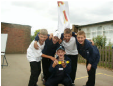
The proud creators of 'Vendetta'

Creative Car Competition: WINNER – 'Beauty'