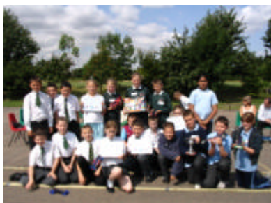
6. Group photo

Creative Car Competition: WINNER – ‘Glitter Bug’ by Higham Primary School RUNNER-UP – ‘Minnie Mouse’ by Riverview Junior School