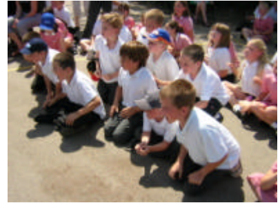
Eager supporters look on!