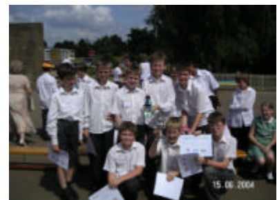
Churchill CEP School