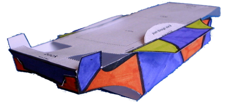
Design Reg. No. 3019063, 3019064, 3019065 COMPLETE BODY