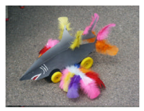
'Polly Shark' - Challock Primary School

Some of this year's resulting car designs are shown below.