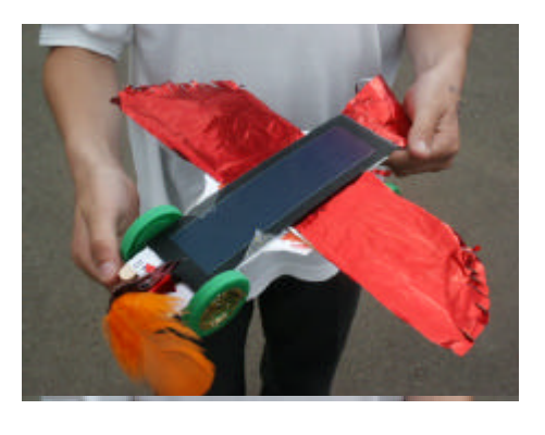
'Flaming Hot Dragon' – Palmarsh Primary School