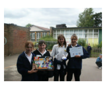
Creative car winner 'Beauty'