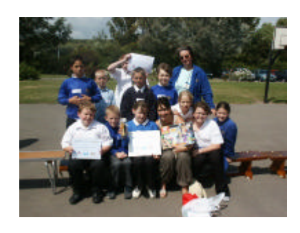
St Peter's Primary School team