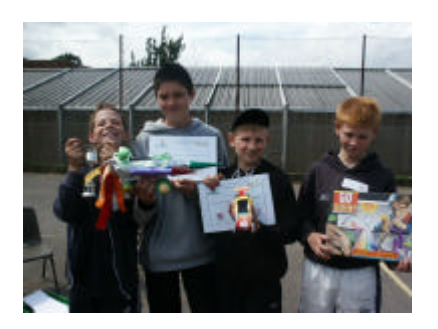
The champions from Barn End Centre