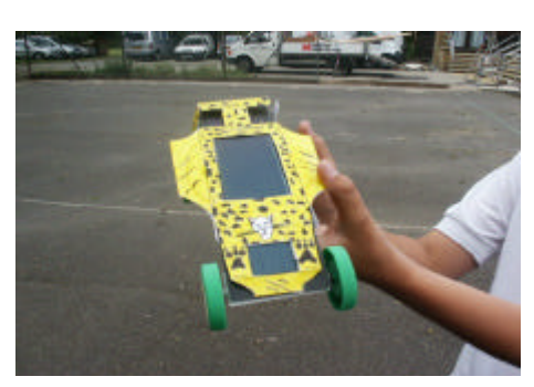
'The Cheetah' – Cage Green Primary School