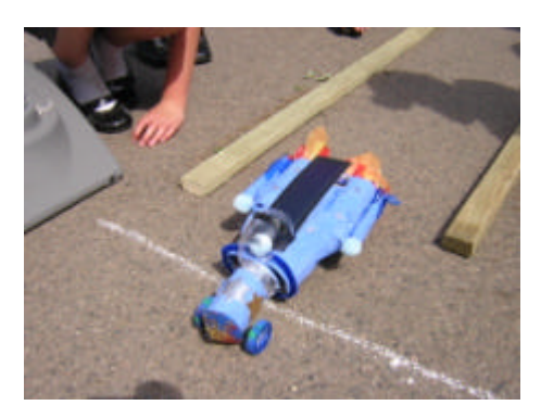
'Graveney Solar Star' – Graveney Primary School