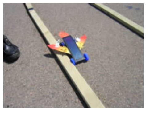
'Thunderflyer' – Sheldwich Primary School